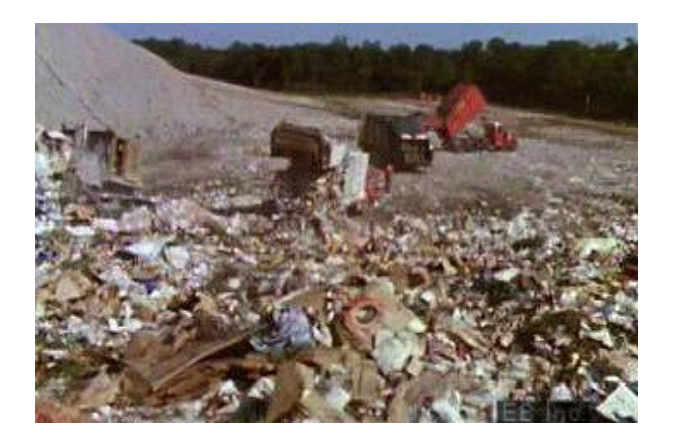
Explore how bacteria and other microorganisms decompose solid-waste efficiently in sanitary landfillsConstruction of a sanitary landfill.

Land disposal is the most common management strategy for municipal solid waste. Refuse can be safely deposited in a sanitary landfill, a disposal site that is carefully selected, designed, constructed, and operated to protect the environment and public health. One of the most important factors relating to landfilling is that the buried waste never comes in contact with surface water or groundwater. Engineering design requirements include a minimum distance between the bottom of the landfill and the seasonally high groundwater table. Most new landfills are required to have an impermeable liner or barrier at the bottom, as well as a system of groundwater-monitoring wells. Completed landfill sections must be capped with an impermeable cover to keep precipitation or surface runoff away from the buried waste. Bottom and cap liners may be made of flexible plastic membranes, layers of clay soil, or a combination of both.